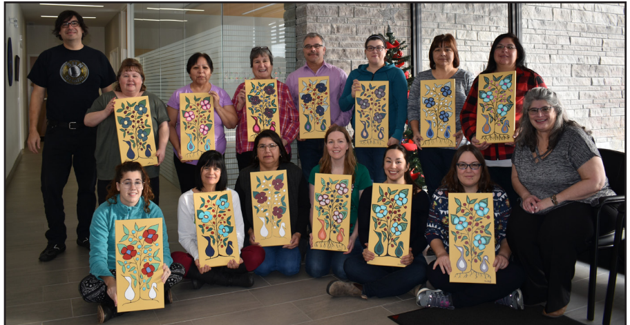
KEB staff gathered on December 10 and 11, 2019, to participate in facilitation training. They also celebrated Christmas with a paint social and gift exchange.

Here we are at the end of another year, and the end of a decade. What a year it has been for the Anishinabek Education System!